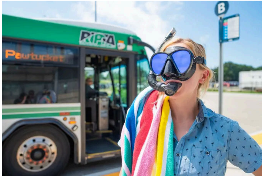
Woman wearing a scuba mask and snorkel stands in front of a bus with her beach towel.

RIPTA will implement summer service changes effective Saturday, June 21, 2025. RIPTA makes regular service adjustments three times a year in response to seasonal changes and/or passenger use. These annual changes are minor and include the start of selected summer services, and changes to trip times. Click here for details.