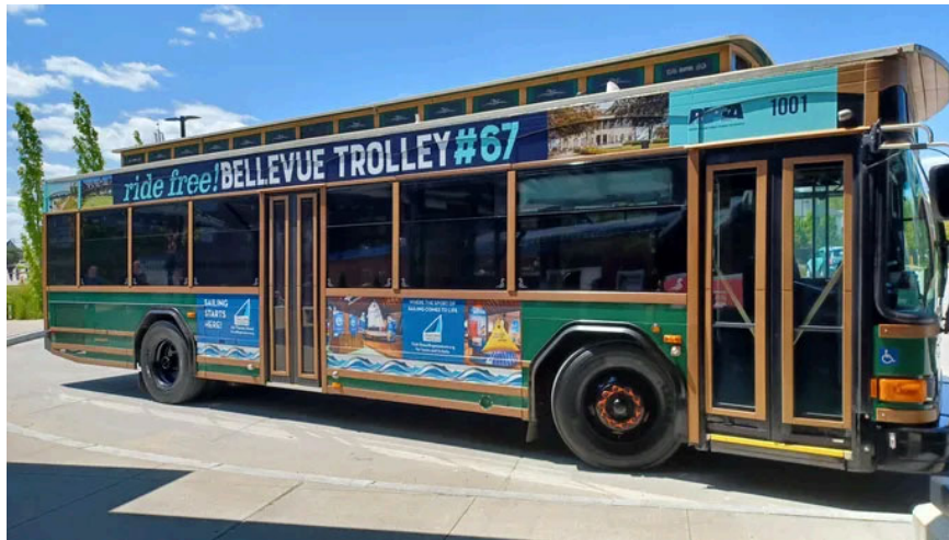
A trolley that reads "Ride free! Bellevue Trolley #67."