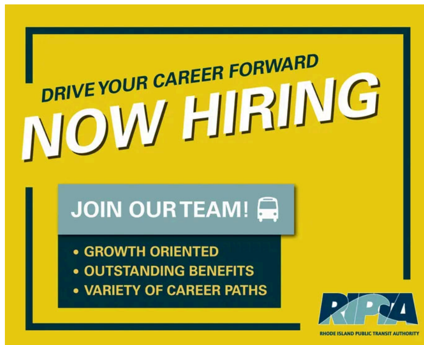
"Now Hiring" graphic.