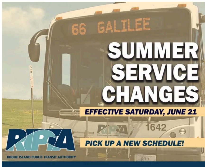
Summer service changes effective Saturday, June 21. Pick up a new schedule!

This summer, passengers can ride Route 67 and Route 68 FOR FREE! Funded by Discover Newport and the Episcopal Diocese of Rhode Island , passengers can hop-on and hop-off these two routes through October 31, 2025, at no charge. The service offers transportation around Newport to tourist destinations and beaches. Visit RIPTA.com/Newport for details.