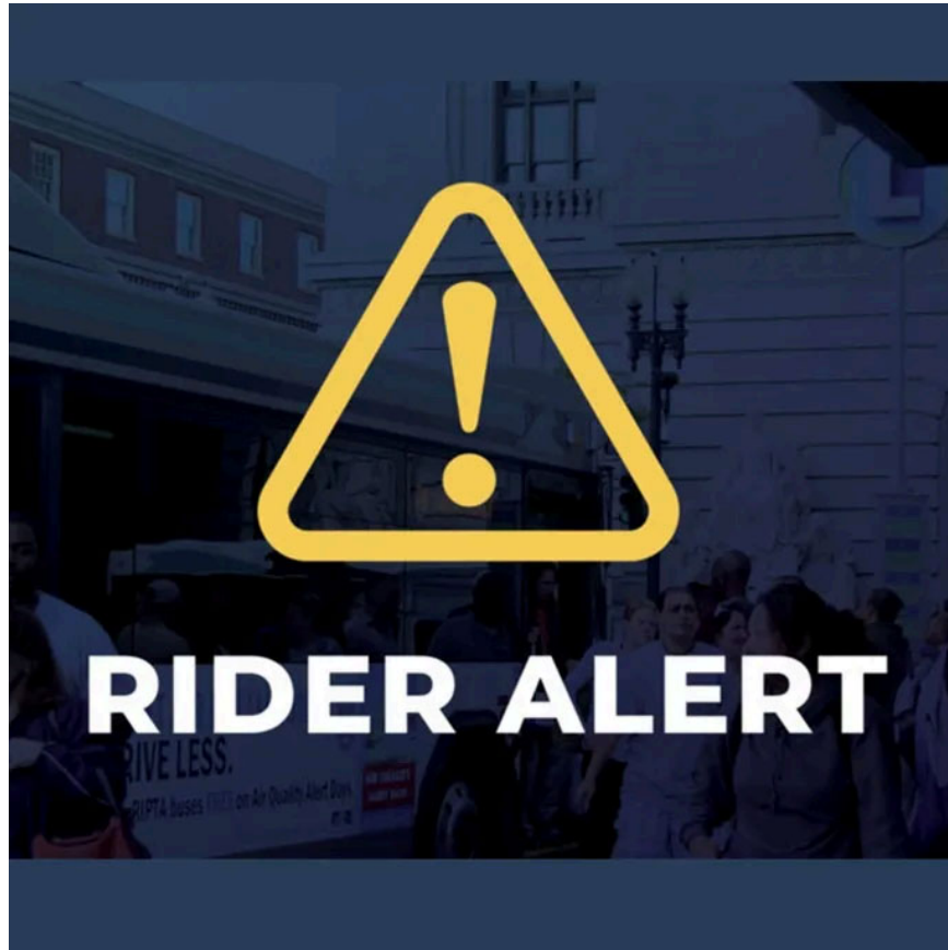
Rider Alert Graphic.

For information on how to qualify for RIPTA's Reduced Fare Program for Seniors and People with Disabilities, customers can call (401) 784-9500, ext. 2012 or visit RIPTA.com/ReducedFare .