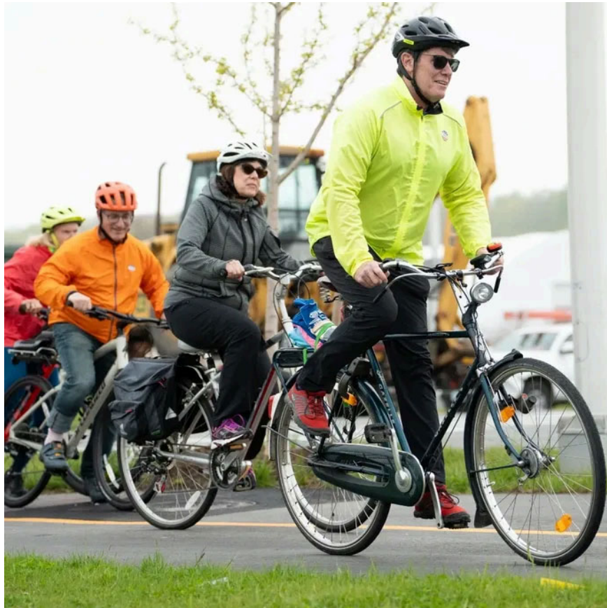
Commuters ride bikes to work for Bike to Work Month.

RIPTA continues to explore and implement clean energy solutions in public transportation, reinforcing its role as a leader in Rhode Island's transition to sustainable mobility options.